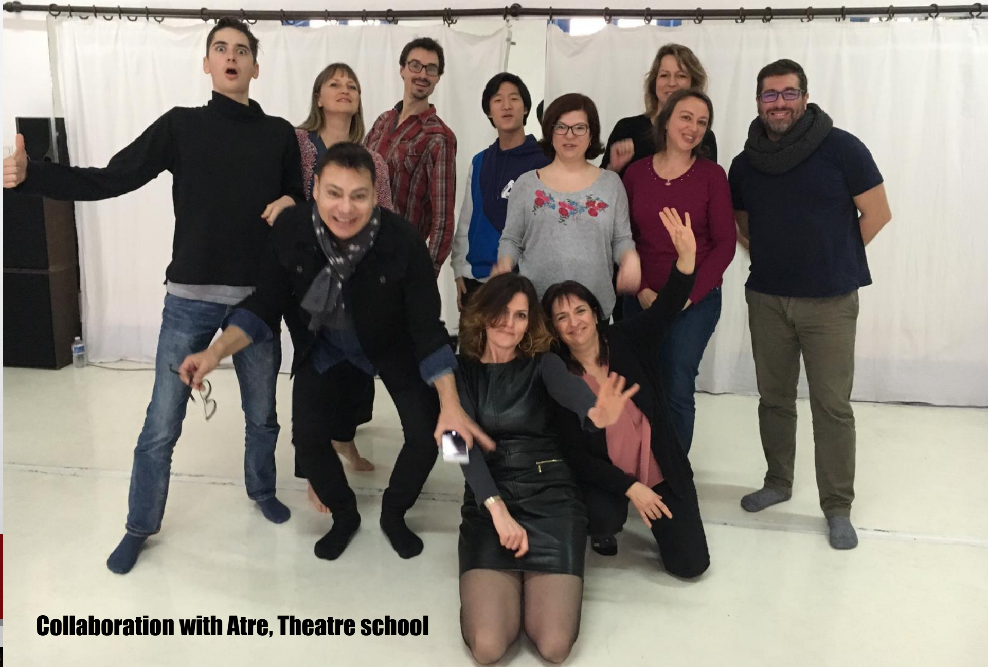
Collaboration with Atre, Theatre school