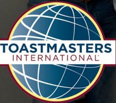
The Super Heros – Toastmaster Officers 2018-2019