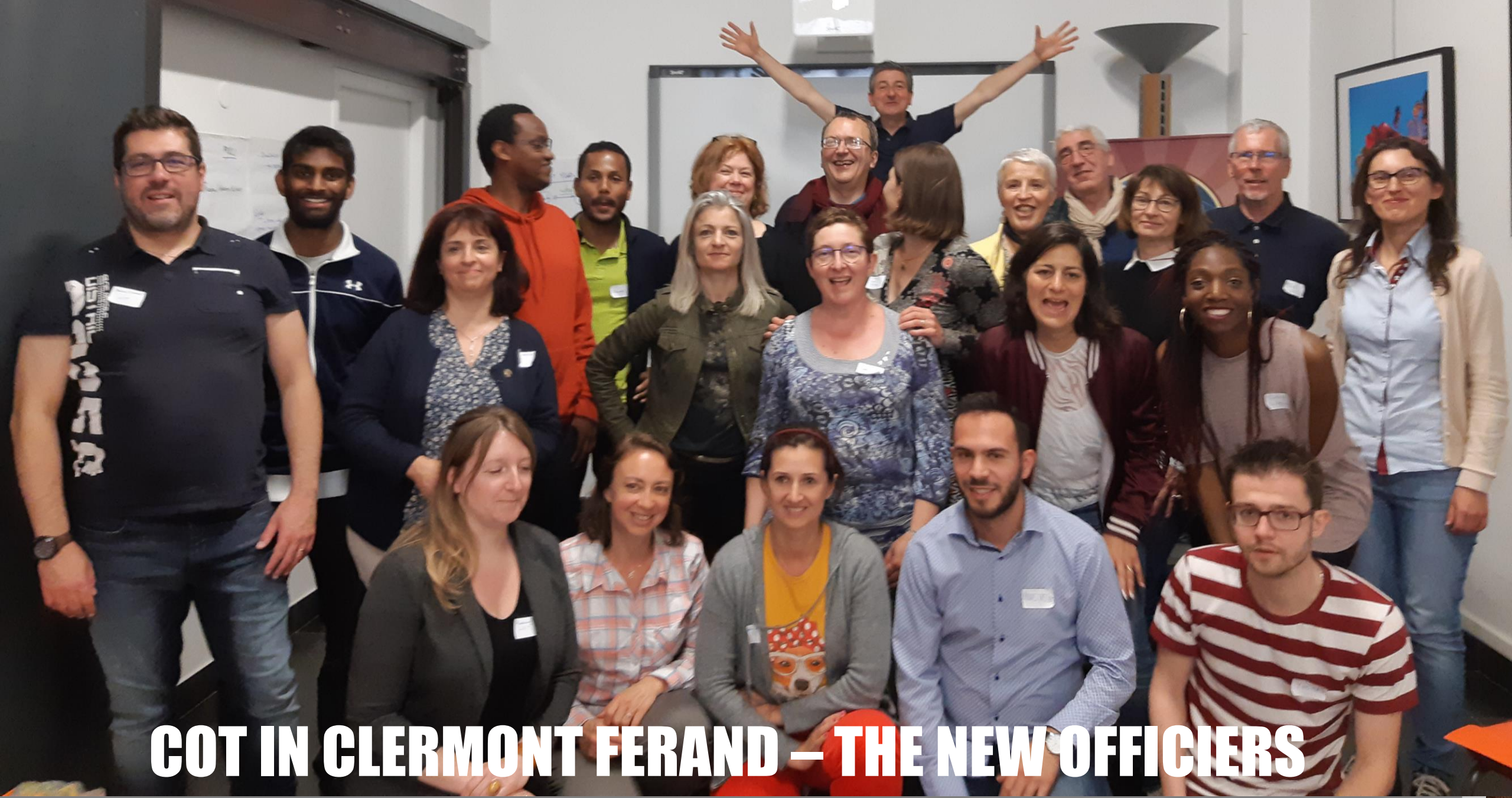
COT IN CLERMONT FERAND – THE NEW OFFICIERS